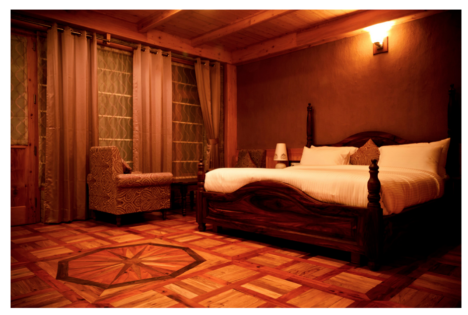
Elite Room at ShivAdya

There are three kinds of rooms: Luxury, Elite and Royal. All rooms are designed keeping the traditional Himachali homes in mind. The mud and stone walls add that special touch while the hardwood floor and ceiling give a warm homely feel. Complete with all modern amenities, each and every room at ShivAdya will satisfy your modern needs and at the same time take you back in time, to your roots.