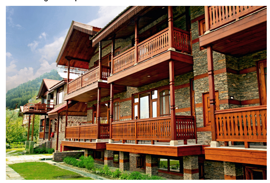
Cottage block at ShivAdya

ShivAdya is located in Karjan village, just about 20 minutes from the town of Manali. Not being in the town places the resort in one of the quietest corners of Manali, away from the streets packed with tourists and the residual hustle-bustle of the city that may have made