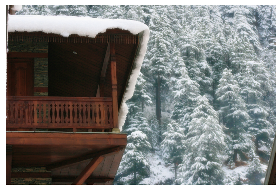
Winter wonderland, anyone?