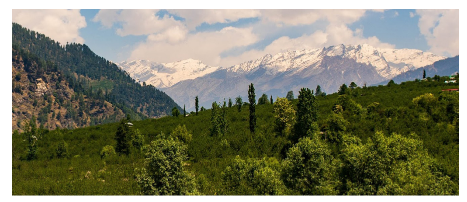
The fantastic view of the great Himalayan ranges from ShivAdya Resort & Spa

Slept throughout the journey, only to wake up right before reaching Manali.