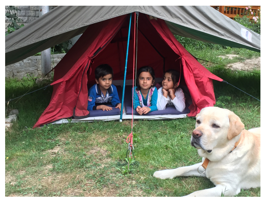
ShivAdya\ is\ a\ fun\ place\ for\ kids.\ That's\ everyone's\ favourite:\ Boxy\ the\ yellow\ labrador

Located just 8km away from the resort is Naggar, your perfect choice of a place for a splendid view of the valley down below. Here at Naggar one can visit the Naggar Castle, Gaurishankar Temple of Tripura Sundari Devi, Vishnu Temple and Krishan Temple. If temple is not your thing, then head to Nicholas Roerich Art Gallery.