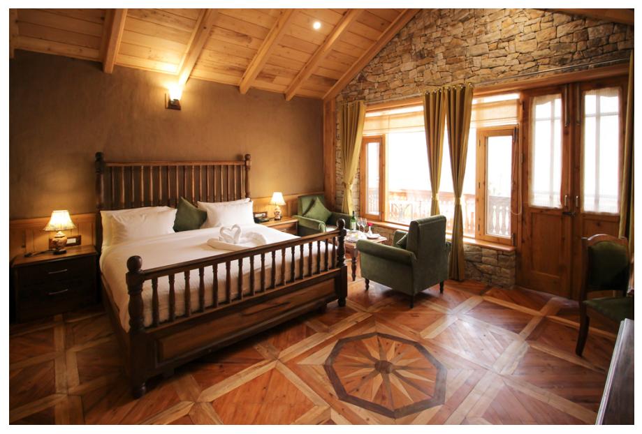
Royal Room at ShivAdya

it's way to Manali through its visitors. At ShivAdya, the first thing that one experiences is the space. The vast resort grounds has just 15 well-appointed rooms. The folks at ShivAdya believes in free space and that's what they try to offer in all of their rooms. Speaking of rooms, did I already talk about how every single rooms at ShivAdya is a beautiful mix of stone, mud and wood. Not a single scrap of paint in any of the rooms, restaurant and reception included. Though you may find that singular room at the spa. Because steam, you see. The resort is flanked by snow-clad Himalayan ranges, vast valley below, luxuriant apple orchards and dense pine forest