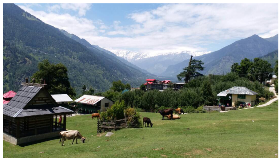
Hike to a neighbouring village

And this does not just mean eat local. Though the locally grown rice is a must try. Take a whiff of the cooked rice and you will know why. Sticky and fragrant, it will give any fancy sticky rice a good run for their money. The food at the resort is delicious, simple, traditional and locally sourced.