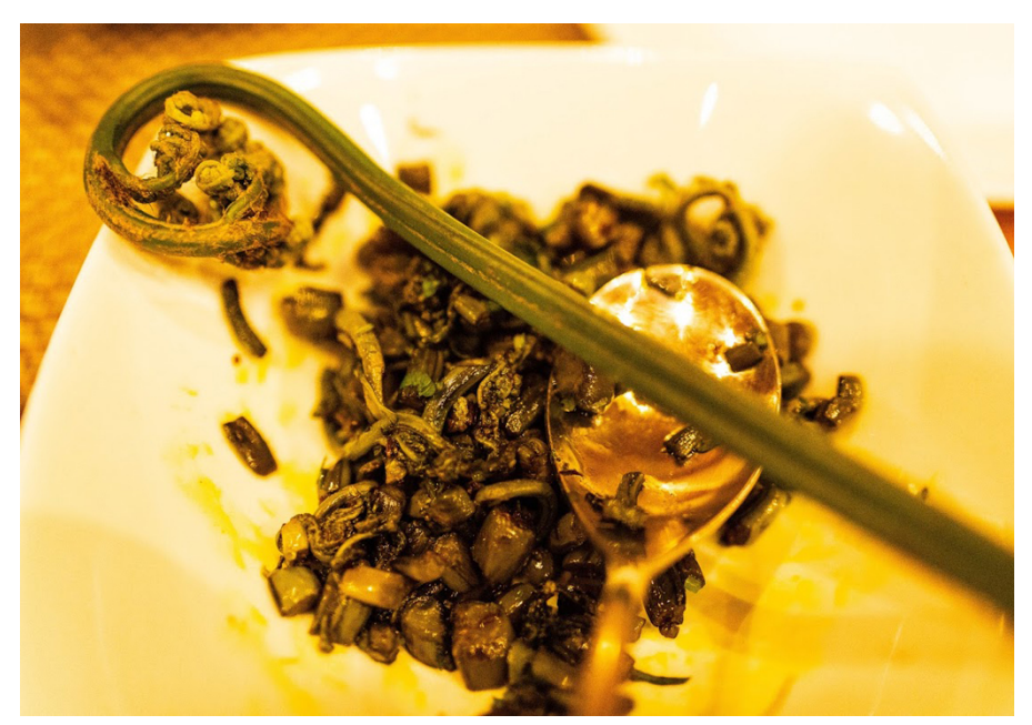
Local vegetables served at ShivAdya. In picture: fiddlehead fern

Old Manali--backpacker's haven, Solang valley with its fantastic view of glaciers, snow-clad mountains and ski slopes, Rohtang Pass, Kullu and Manikaran, these are just some of the popular tourist attractions, not very far away from the resort. If you plan for just a couple of days, then worry not, for there are woods nearby where one can go and be one with nature. Go explore!